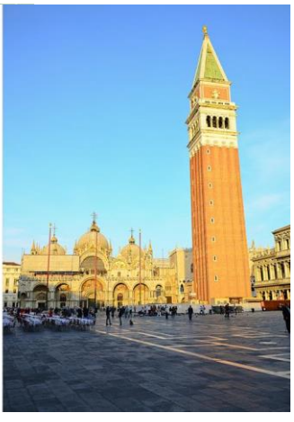
10 Days ● 13 Meals: 8 Breakfasts, 1 Lunch, 4 Dinners