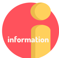
Table of Contents & Information